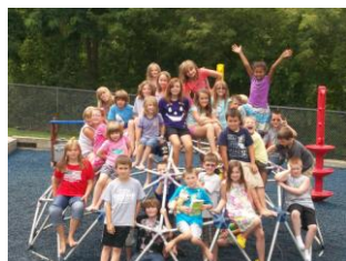
SUMMER CAMP 2012