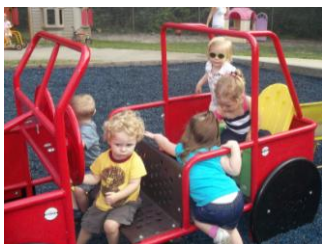
Going on a drive...